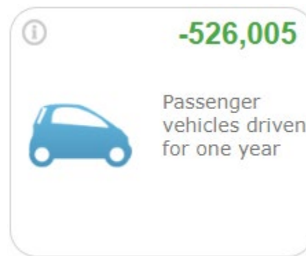
Recycling vs. Landfill

Passenger vehicles: 2-axle 4-tire vehicles (cars, vans, pickup trucks, and SUVs)