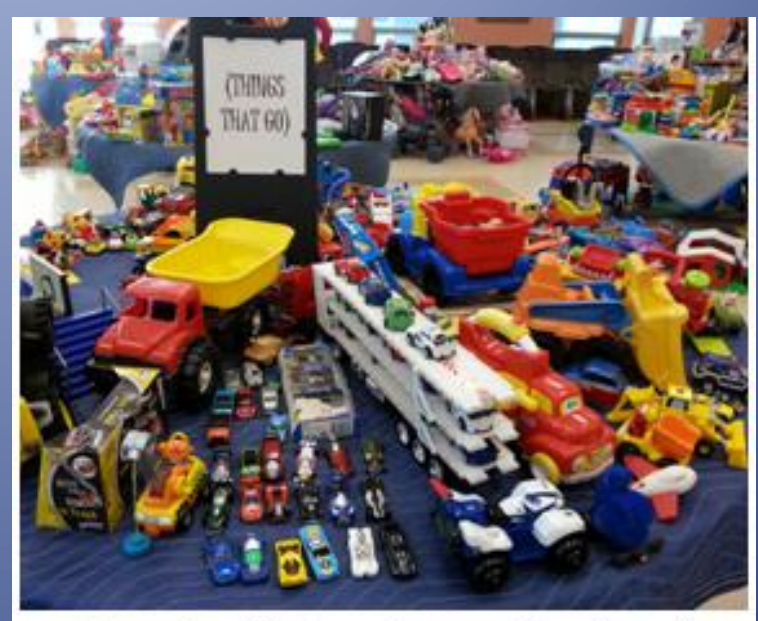
Have lonely trucks needing love? We can help.