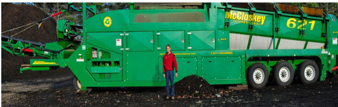
Brick Ends Farm

Hiltz Disposal provides curbside collection of organics and recyclables with a split-body truck on a weekly basis for organics and recyclables.