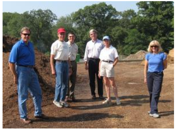
Town officials & Recycling Committee members gather at Brick Ends Farm to promote the organics program

Moving trash collection to every other week allowed the Town to offer weekly collection of organics and recyclables with only a minimal increase in hauling charges. The use of the split-truck for collection of organics and recyclables and an automatic cart collection system for trash has proven to be cost-effective for both the hauler and the Town. The hauler (Hiltz) pays Brick End Farm $40 per ton for processing the organics, 7 compared to $70/ton tipping fee for trash delivered to a disposal facility. Brick End Farm offers free grade #1 screened compost to program participants.