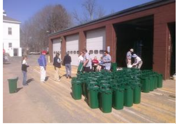
Town Volunteers ready collection cart distribution

The first pilot was free for participants. However, for the second pilot, participants paid $75 for collection once a week for a year and $29 for a kitchen collection bucket and a green curbside cart with wheels and a latched lid. The first 500 households to sign-up for the program received free collection carts and buckets, through a $7,000 grant awarded to Hamilton by MassDEP and private donations.