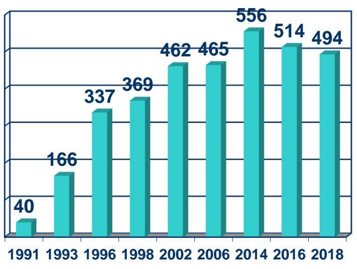
Number of MRFs by Year