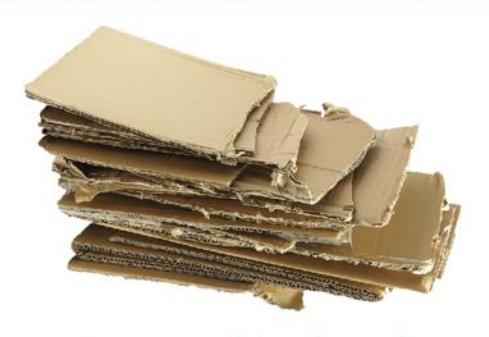
Corrugated Cardboard (Wavy center layer)