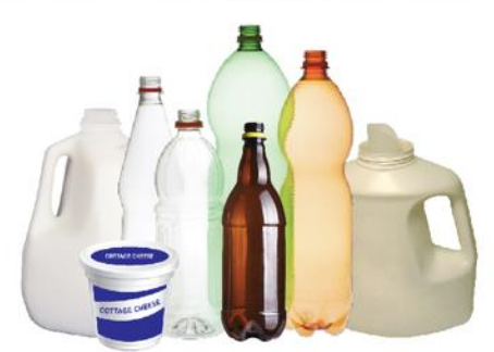
Plastic Bottles, Jars, Tubs, & Lids (Empty kitchen, laundry, & bath containers)