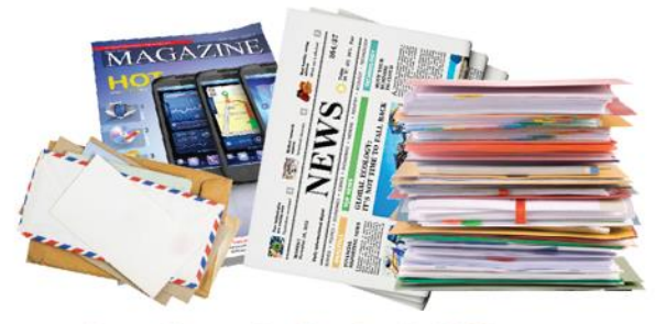
Junk Mail, Periodicals, & Office Paper (Envelopes, catalogs, & soft cover books)