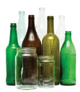
Glass Bottles & Jars (Empty food & beverage bottles & jars)